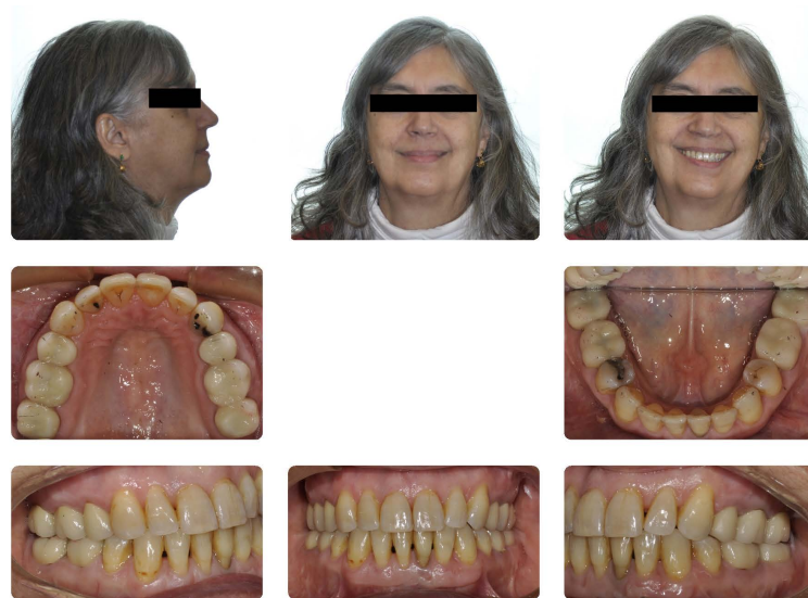
Figure 5. Post-treatment extraoral and intraoral photographs.