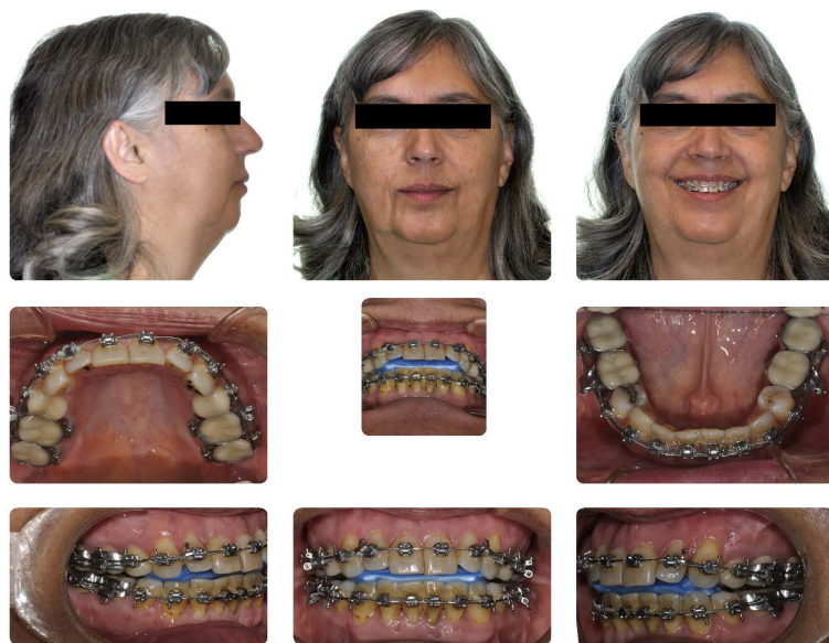
Figure 4. Pre-telegnathic surgery extraoral and intraoral photographs.

Teledontics and telegnathic treatment protocol is the science and technologies for diagnosis, prevention, management and treatment of SDB by means of expansion, restoration and maintenance of POF complex [24] [31] [32].