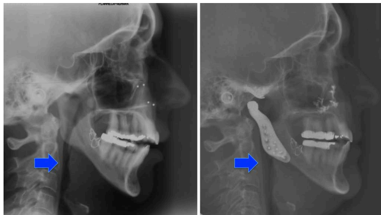
Figure 6. Pretreatment and post-treatment lateral view cephalometric radiographs (Arrows point to the enlargement of the airway before and after treatment).

CC/MMA as teledontic/telegnathic protocol by expansion of the posterior nasopharyngeal opening also augment the nasal cavity. A nasal cavity volume increase should reduce the resistance to nasal airflow [38]. If the upper airway is considered a simple tube, as the radius of the tube increases, the resistance to flow decreases exponentially to the fourth power (resistance = 8 L\eta/\pi r^4 ) [39]. Therefore, even small increases in the diameter of the tube can dramatically decrease the resistance to nasal or pharyngeal air flow [39].