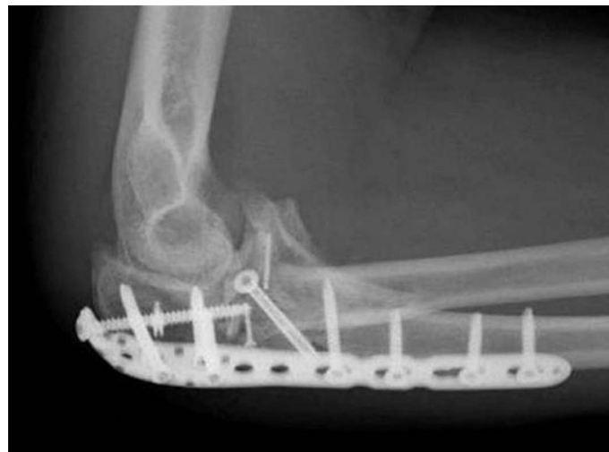
Figure 4. Osteosynthesis by hooked screw plate of a pseudarthrosis of complex fracture (fracture type III).