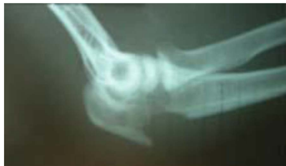
Figure 3. Olecranon pseudarthrosis secondary to single fracture AI treated orthopedically.