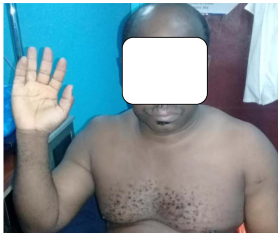
Figure 5. Postoperative evolution after synthesis of a pseudarthrosis of the olecranon.

Pseudarthroses are severe late complications of olecranon fractures. Epidemio-