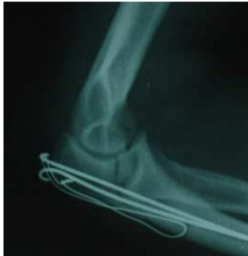
Figure 2. Pseudarthrosis of fracture type I treated by bracing.