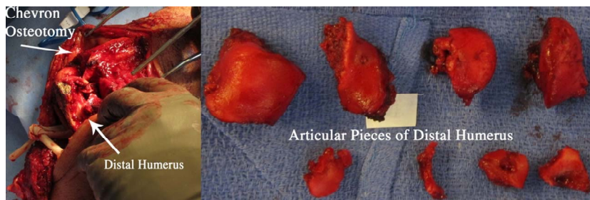
Figure 2. Distal humerus fracture fragments visualized following olecranon osteotomy.