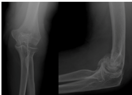
Figure 1. Radiographs demonstrate a displaced intra-articular distal humerus fracture.

The patient was placed supine with a bump under the ipsilateral scapula. A posterior surgical approach was made, initially exposing and isolating the ulnar nerve. Next, open reduction internal fixation of the distal humerus was attempted; with creation of para-tricipital windows and a chevron type olecranon osteotomy. Direct fracture visualization revealed multiple small fracture fragments not amenable to internal fixation. ( Figure 2 ) Intra-operative decision was made to proceed with a semiconstrained TEA.