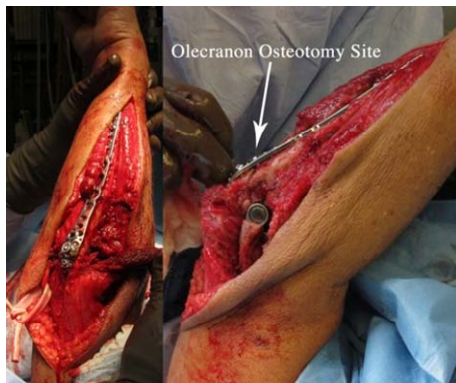
Figure 3. TEA and olecranon osteotomy repair using bridge plate.