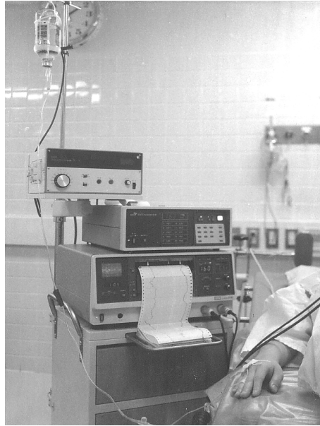
Figure 2. Automatic oxytocin infusion labor induction system programmed by Maeda and provided by T0ITU (Tokyo).