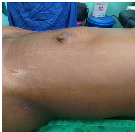
Figure 1. Arch of the right iliac fossa.

At the entrance exam, the temperature at 37.4°C, the blood pressure at 110/60 mmHg, and the pulse rate at 100 bpm. The right iliac fossa was arched Figure 1 . The abdomen was entirely sensitive with a firm, not very mobile tender mass stretching from the right iliac fossa to the pelvis. At the gynecological-obstetric examination, the uterus was supra-pubic palpable, deviated to the left. There was lack of vaginal discharge, a softened, closed, and short posterior cervix. The hemoglobin level was 9 g/dl, and the white blood cell level was 12,000/mm 3 , and the platelet count was 370,000 mm 3 . The ultrasound (US) carried out as a matter of urgency showed a void in the splenic chamber and a heterogeneous mass