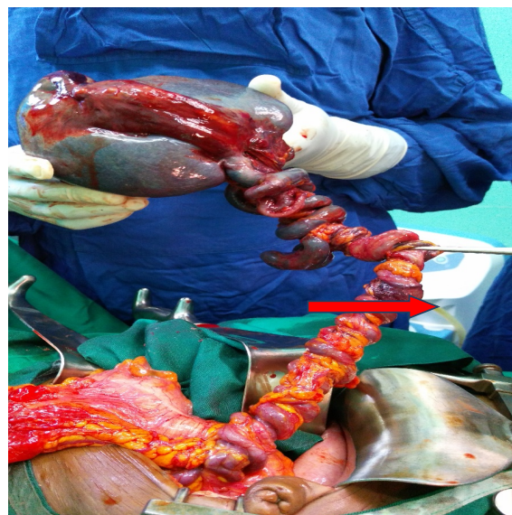
Figure 3. Splenic pedicle of 50 cm not joined and twisted in many spiral turns clockwise.