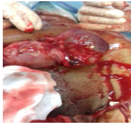
Figure 3. Right unruptured tubal pregnancy.

BEP, it must be entertained in the differential diagnosis because the consequences of missing it are likely to be catastrophic [3]. Its true incidence is not known, but because it has been reported with increasing frequency in a recent time, may be on the increase [6]. Higher incidence of BTP has been seen after the use of Assisted Reproductive Techniques (ARTs) or following ovulation induction [7].