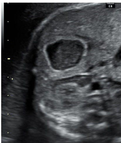
Figure 1. High brightness echo was observed in the fetal stomach bubble.