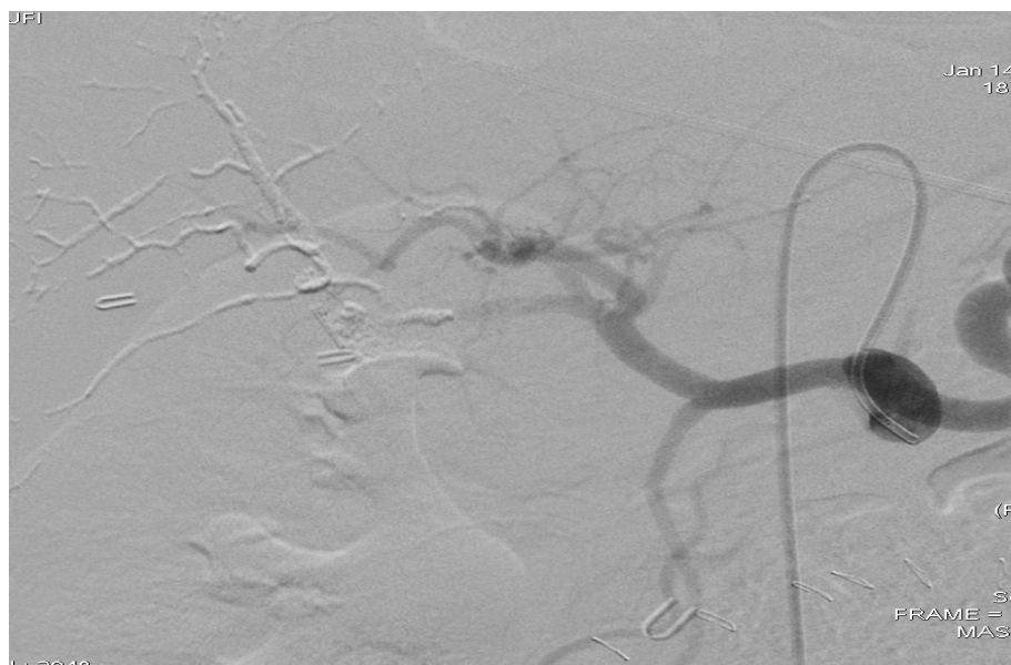
Figure 1. Arteriography of the hepatic artery, embolization of pseudoaneurism.

Hemobilia is a rare entity. It is classically associated with Quincke's triad of biliary colic, jaundice, and gastrointestinal bleeding; however, the complete triad is reported in less than 40% of patients [2] [3]. A significant