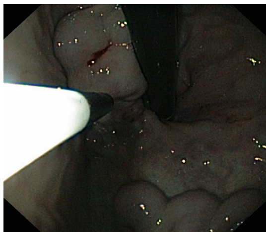
Figure 2. Injection of histoacryl.