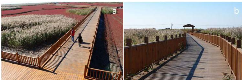
Figure 2. Boardwalks from tidal influent (a) to upper delta reed wetlands (b) in the Liaohe Delta were built in 2012.

Rice is a major agricultural crop in China and in the LHD. We estimated the value of this service in 2007 to be the median value cited by de Groot et al. [28] for coastal wetlands, US $7134 \text{ha}^{-1}\cdot\text{y}^{-1} (Table 1).