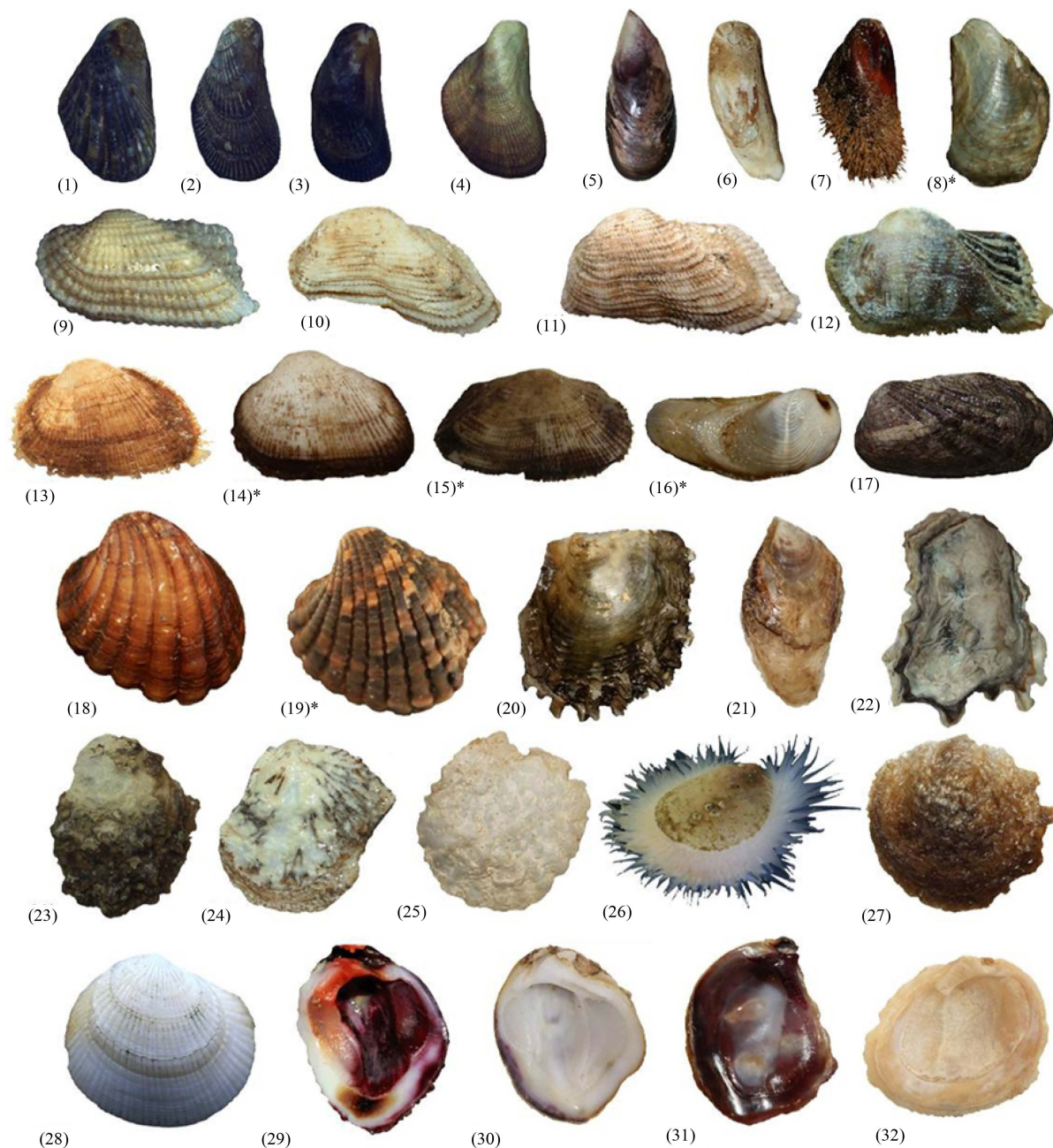
(1) Brachidontes adamsianus (2) B. puntarenensis (3) B. semilaevis (4) Septilifer zeteki (5) Choromytilus palliopunctatus (6) Lithophaga aristata (7) Modiolus capax (8) M. tumbezensis (9) Acar gradata (10) A. pusilla (11) A. rostrae (12) Arca mutabilis (13) Barbatia Lurida (14) B. illota (15) B. reeveana (16) Martesia striata (17) Carditamera affinis (18) Cardites grayi (19) C. laticostatus (20) Pinctada mazatlanica (21) Isognomon janus (22) Saccostrea palmula (23) Striostrea prismatica (24) Plicatula penicillata (25) Plicatulostrea anomioides (26) Lima pacifica (27) Pododesmus foliatus (28) Ctena clarionensis (29) Chama coralloides (30) C. echinata (31) C. mexicana (32) C. sordida .