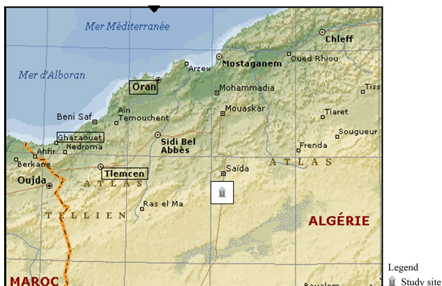
Figure 1. Location of the study area.

These three stations are representative of steppe rangelands. In each of these formations ten floristic surveys related to ten soils were made.