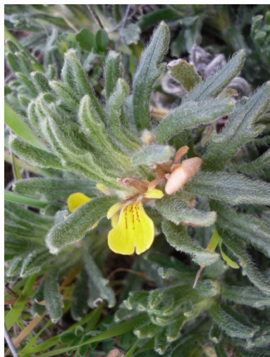
Ajuga iva subsp. pseudoiva (DC.) Briq.