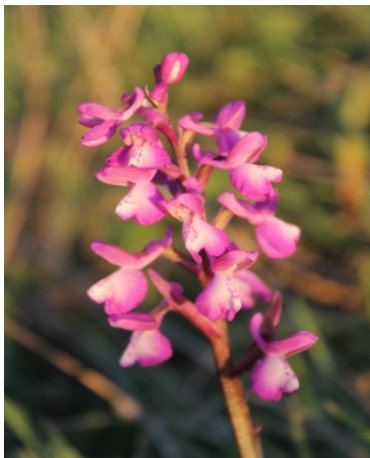
Anacamptis morio subsp. tlemcenensis (Batt.) E.G. Camus

Planche 1. Board color.