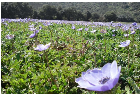
Figure 5. Annual plant lawn with Anemone coronaria before Moutas plain crops. Photo. Babali B., March 2011.

“in the short-cycle crops adapted to use a fleeting resource, tolerance and/or need of light (light-demanding species) make them exclusive or preferential plants of-