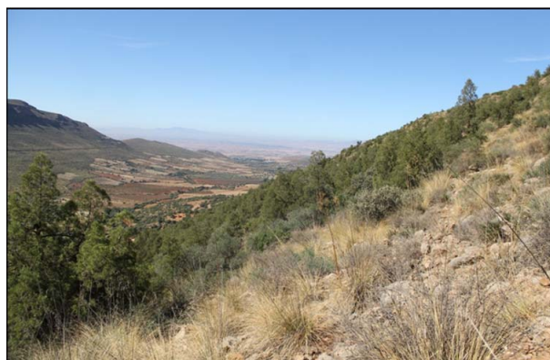
Figure 4. Degraded forest Tetraclinis articulata based at Tameksalet-Moutas (south side). Photo. Babali B., October 2012.

The reserve is surrounded by natural sources: Aïn-Boumedrer the largest and most common, AïnE-Djedi, Aïn Moutas and Aïn El-Ben. The vegetation, adjacent to these springs and streams, is riparian representing vegetation structure at least partly azonal [31], or indicators of wetlands such as Rubus ulmifolius Schott, Dittrichia viscosa (L.) Greuter, Typha latifolia L., Carex hispi-