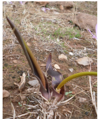
Biarum Bovei subsp. dispar (Schott.) Engler