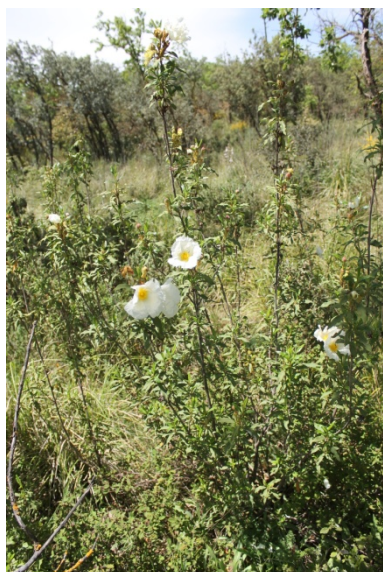
Cistus ladanifer subsp. Mauritanus Pau & Sennen