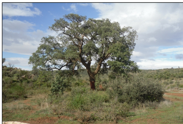
Figure 3. Relic of cork oak. Sahb El Ababda (Moutas). Photo. Babali B. October 2010.

The vegetation associated with these cork oak is: Lavandula stoechas L., Anagallis arvensis L., Erica arborea L., Arbutus unedo L., Stauracanthus boivinii (Webb) Samp Ampelodesmos mauritanicus (Poiret) Durand & Schinz, Asparagus acutifolius L., Daphne gnidium L., Cytisus villosus Pourret, Cistus clusii Dunal., Cistus creticus L., Cistus salvifolius L., Cistus ladanifer subsp.