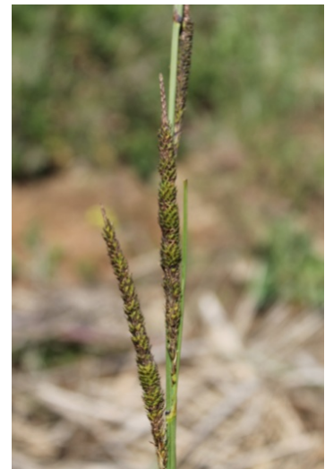
Carex hispida Willd.