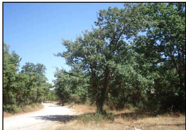
Figure 2. Quercus faginea subsp. tlemcenensis formations at Torriche (Moutas). Photo. Babali B. September 2011.

This oak occupies 1/5 th of the reserve with an area of 428 ha. It is found mainly in the southern and south-