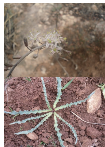
Drimia undulata Jacq.