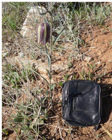
Fritillaria lusitanica subsp. Oranensis (Pomel) Valdés