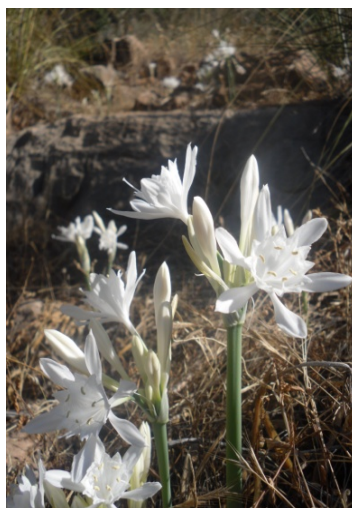
Pancratium foetidum var. oranense Pomel