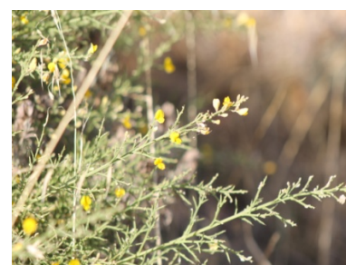
Stauracanthus boivinii (Webb) Samp