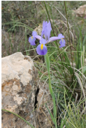
Iris xiphium L.