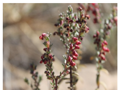
Odontites purpureus subsp. purpureus (Desf.) G. Don fil.