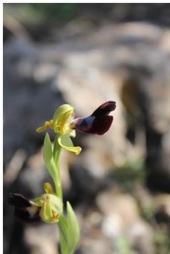
Ophrys atlantica Munby