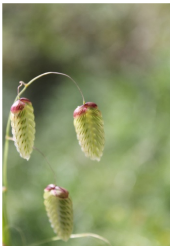
Briza maxima L.