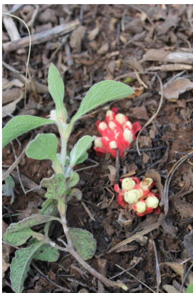
Cytinus hypocistis subsp. clusii Nyman + Cistus villosus Pourret