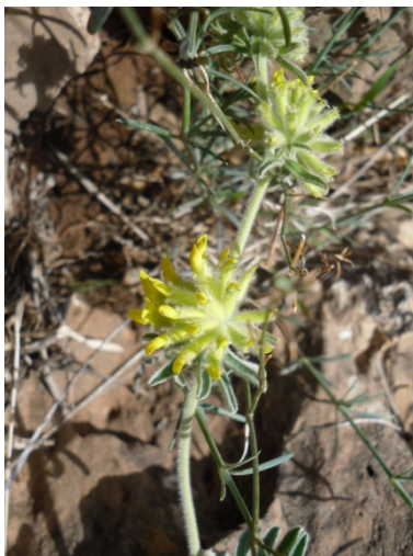
Anthyllis polycephala Desf.