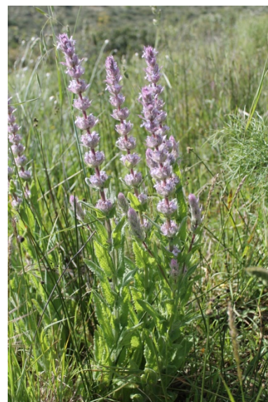
Nepeta tuberosa subsp. reticulata (Desf.) Maire