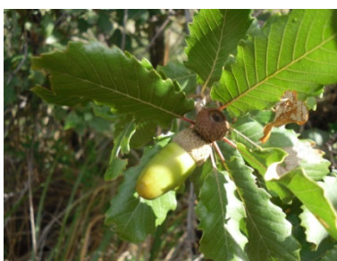
Quercus faginea subsp. ilemcenensis (OC.) Maire et Weiller