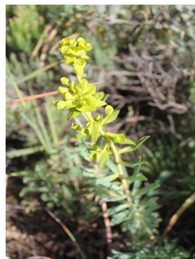
Euphorbia nicaeensis All.