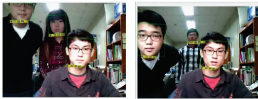
(a) 3 faces recognition (b) un-registration search