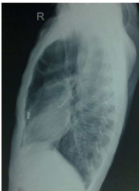
Figure 2. Chest X-ray lateral view.

junction. But in patients with esophagectomy and gastric pull up, the optimal position of the NGT tip and its confirmatory method is not mentioned in the literature. Single method of detecting the correct placement of the NGT may miss the misplaced NGT in patients who have altered anatomy due to surgical procedure. We suggest in patients with esophagectomy and gastric pull up, the confirmation of the correct placement of the NGT should be done by more than one methods including history of previous surgical procedure, pH of the aspirate and the radiographic evaluation. Also the NGT tube should be placed under direct vision using the laryngoscope and we should be cautious in interpreting the chest radiograph for correct placement of NGT in patient with gastric pull