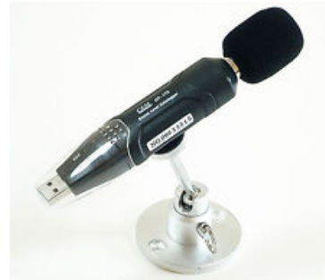
Plate 1. DT-173 High accuracy digital sound noise level data logger.

as the occupants' perception of the acoustic condition in the rooms. Other personal characteristics like weight and height were measured using Generic height and weight scale. These were used to calculate the Body Mass Index (BMI), the Body Metabolic Rate (BMR), and the Body Skin Area (BSA). The BMI was calculated using Equation (1) (United States Department of Health and Human Services); the BMR was calculated using Equations (2a) and (2b) for male and female respectively (Frankenfield, Roth-Yousey and Compher, 2005 [25]); while the BSA was calculated using Equation (3) (Farlex Partner Medical Dictionary, 2012 [26]).