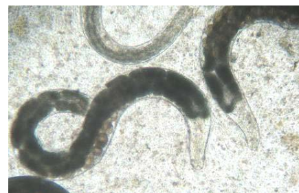
Figure 1. Brightfield micrograph depicting adults of H. bacteriophora under 40× magnification.

Entomoparasitic nematodes (EPNs) Heterorhabditis bacteriophora and Steinernema carpocapsae are utilized as biocontrol agents against various insect pests of agricultural significance (Figure 1). EPN is an attractive organic alternative to chemical insecticides as they do not pose a threat to the environment. Additionally, EPNs are particularly safe for use around humans, livestock, and plants [1]. The close symbiotic relationship between EPNs and their bacterial counterparts contributes to the safety and efficacy of their use as biological control agents.