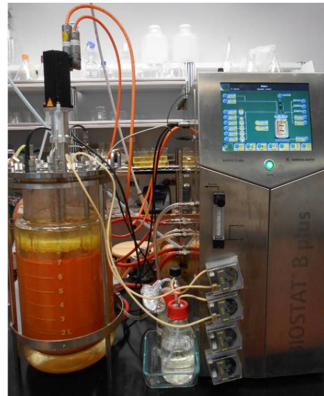
Figure 3. Mass production of H. bacteriophora in a 10 L bioreactor. Note the red pigmentation produced by its bacterial symbiont P. luminescens .

the most cost-efficient process when compared to other methods. Although mass production in submerged culture offers cost-efficiency, capital and technical expertise is still required [20]. Problems arising during nematode mass production are due to many different factors. Some of these factors include phase shifting of the bacterial symbiont, low percentages of nematode copulation, inoculum (bacterial/nematode) concentrations and fermentation parameters (oxygen concentration, pH, temperature, agitation, etc).