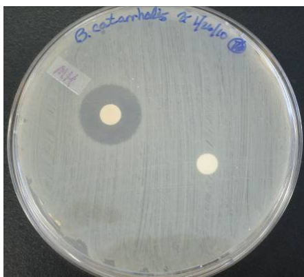
Figure 2. Antibiotic activity from permeate obtained from a culture of P. luminescens . Moraxella (Branhamella) catarrhalis is the test subject.

Mass production of Heterorhabditis bacteriophora and Steinernema carpocapsae on a large scale is difficult and cumbersome either in vivo or in vitro due to various obstacles (Figure 3). Production of EPNs can be achieved in vivo ; however, commercial scale production is impracticable due to high production costs and low nematode yields per gram of insect biomass [16,17]. EPN production with in vitro solid technology gives rise to higher nematode yields per gram of solid media when compared to in vivo technologies. However, costs associated with solid media technologies are much higher than in vivo technologies. The high production cost is mainly associated with labor, materials and storage area [18,19]. To many researchers, in vitro liquid technologies should be used in commercial production of EPNs for international markets because these technologies are considered to be