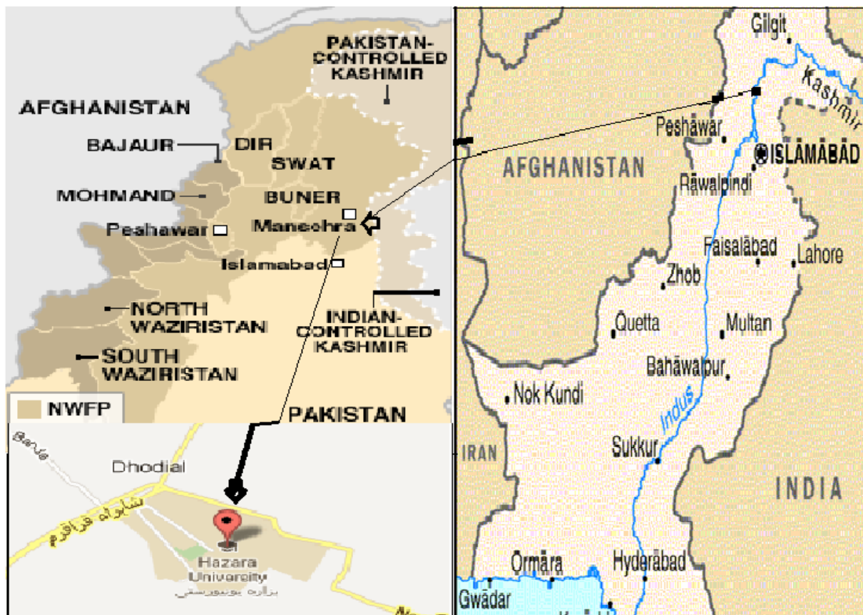
Figure 1. Map of Mansehra, Pakistan [13] where the survey area, Hazara University is located.

Mansehra district covers about 4579 km 2 areas. It lies from 34°14' to 35°11' north latitudes and 72°49' to 74°08' east longitudes in Hazara Division, Pakistan [14]. Hazara