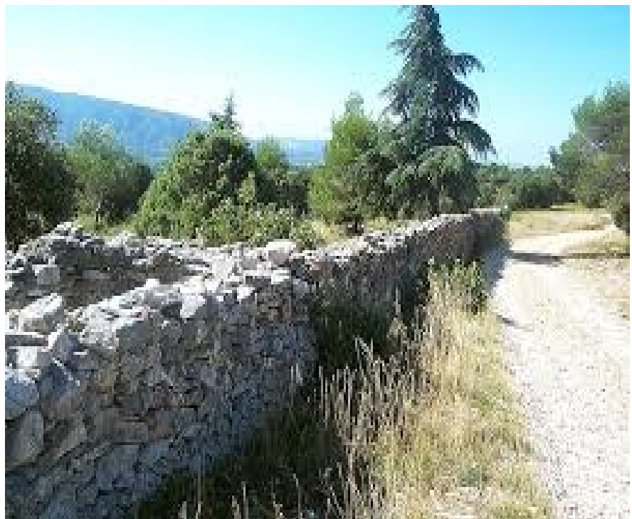
Figure 7. The “Mur de la peste” (The wall of the pest-house).

can still be seen in different parts of the Plateau de Vaucluse ( Figure 7 ).