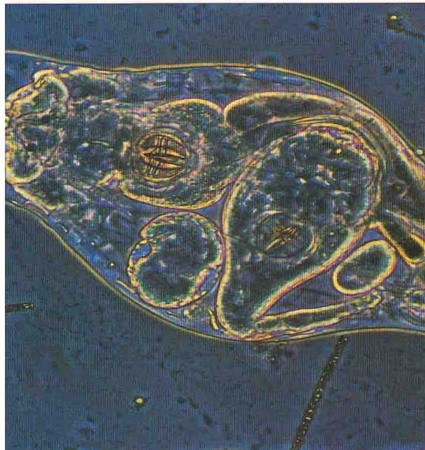
Figure 1. A bacterium viewed through an electron microscope.

During 1346-1353, the Black Death spread across Europe. The dreadful name, however, only came several centuries after its visitation chronicles and letters from the time described the terror wrought by the illness. In Florence, Petrarch anglicized version of Franco Petrarca (1304-1374), Italian poet and the founder of humanism, fleeing the plague of Milan, went to Padua [2]. He was sure that they would not be believed: “O happy posterity, who will not experience such abysmal woe and will look upon our testimony as a fable”.