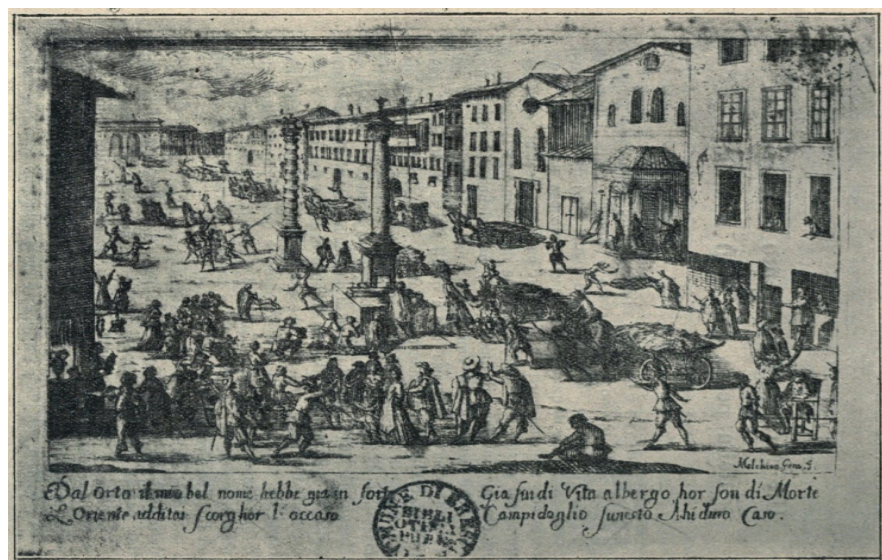
Figure 5. Plague carts carry the dead for burial (Milan: Plague of 1630).

East of Lombardy, the republic of Venice was infected in 1630-1631. The city of Venice was severely hit, with recorded casualties of 46,000 people out of a population of 140,000. Some historians believe the drastic loss of life, and its impact on commerce, ultimately resulted in the downfall of Venice as a major commercial and political power. The papal city of Bologna lost an estimated