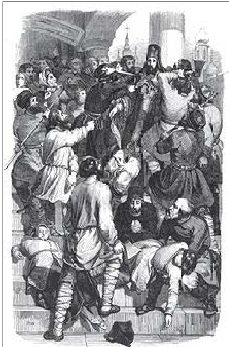
Figure 8. The murder of Archbishop Ambrosius.

There was another unlikely convict—the church bell that was used to start the alarm. By the order of Catherine II, an executor cut the tang from the bell. For