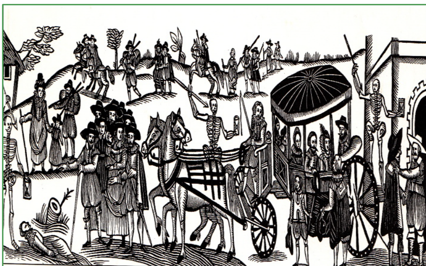
Figure 4. Londoners fleeing from the Great Plague of 1665, when a large proportion of the citizens of London died.