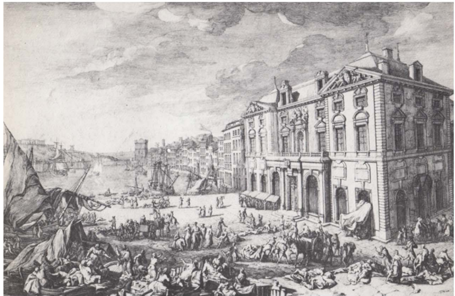
Figure 6. A painting made on the spot, showing the Marseilles town hall with citizens attempting to flee the plague of 1720.