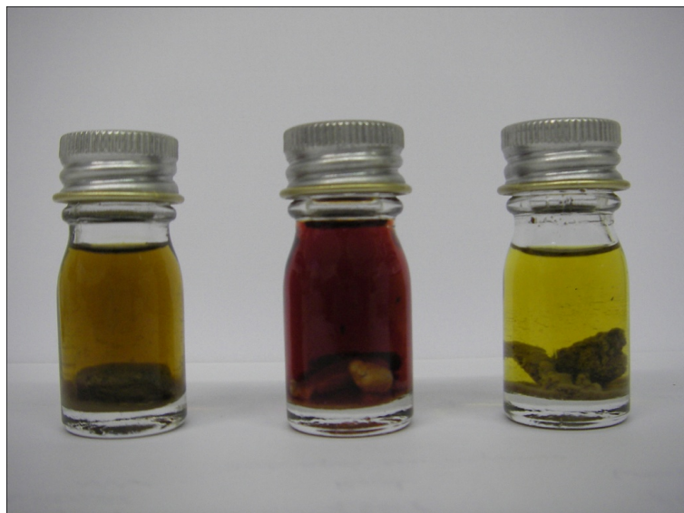
Figure 1. Brown, red and green propolis alcoholic extracts showing the respective colorations.

The Brazilian flora belongs to five macro-regions (North, Northeast, Midwest, Southeast and South). The Southern region (Figure 2) comprises the ombrophilous forest, a field vegetation (“Campos Sulinos”), a “Restinga” formation [20] and patches of a “Cerrado” vegetation in the State of Paraná [21]. The transition of the tropical to a subtropical environment occurs in the state of Paraná, with a great variety of plant associations. Araceae, Arecaceae, Asteraceae, Euphorbiaceae, Lauraceae, Melastomataceae, Myrsinacea and Myrtacea were the most representative families (Troppmair, 1990). The “Cerrado” areas showed different plant taxa [22].