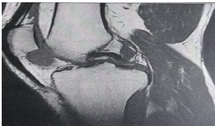
Figure 1. MRI image: in patellar tracking intra "Hoffa".

After a follow-up during six months, the pain decreased significantly and the sensation of instability disappeared.