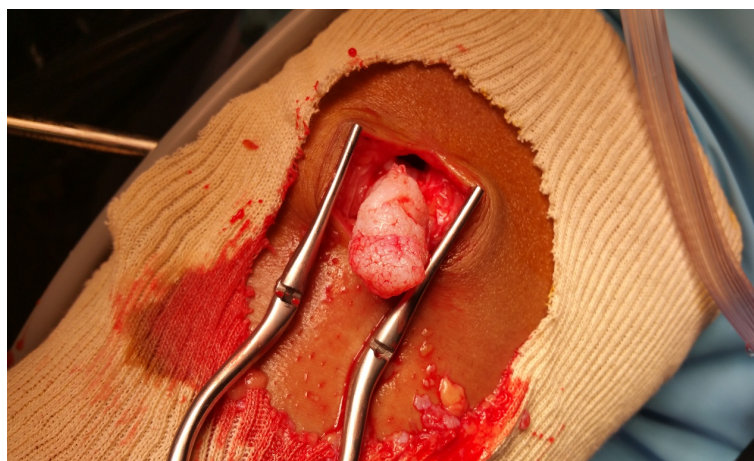
Figure 3. Arthroscopic removal of chondroma.