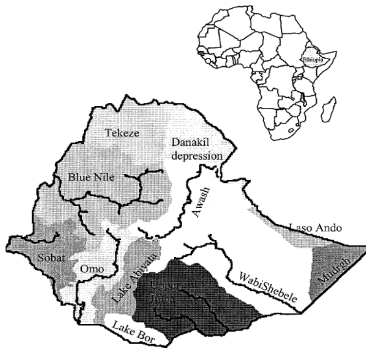
Figure 1. River basins of Ethiopia, Source: [7].