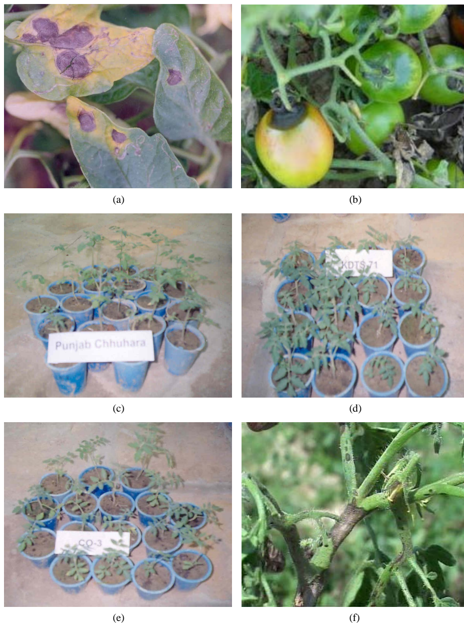
Plate 1. (a) Circular spot with concentric rings; (b) Apical infection on fruits; (c)-(e) Three susceptible varieties of tomato for pathogenicity test; (f) In vivo infection on tomato as stem girdling with sunken lesion.

susceptible and highly susceptible varieties, by previously mentioned methods of screening. Seedlings of the cultivars were raised in pot filled with sterilized soil (Plates 1(c)-(e)). Inoculations were done by different levels of cfu of fungal spore suspension on the one month-old seedling. Ten days old culture of A. solani was taken to prepare spore suspensions which were isolated from native tomato leaf samples and it was grounded in 50 ml of sterilized distilled water with the help of sterilized pestle and mortar. It was filtered with sterilized muslin cloth in a clean conical flask aseptically. cfu s of culture of A. solani suspension were measured on Potato dextrose, rose Bengal, agar medium and standardized three different cfu levels. For maintaining the humidity, a humidifier was set up in this chamber around the pot seedlings of tomato and the temperature was maintained for the development of the symptoms. The percent disease incidence was rated as suggested by [9]. The data were taken on 9 th day to see the immunity of the different cultivars of tomato.