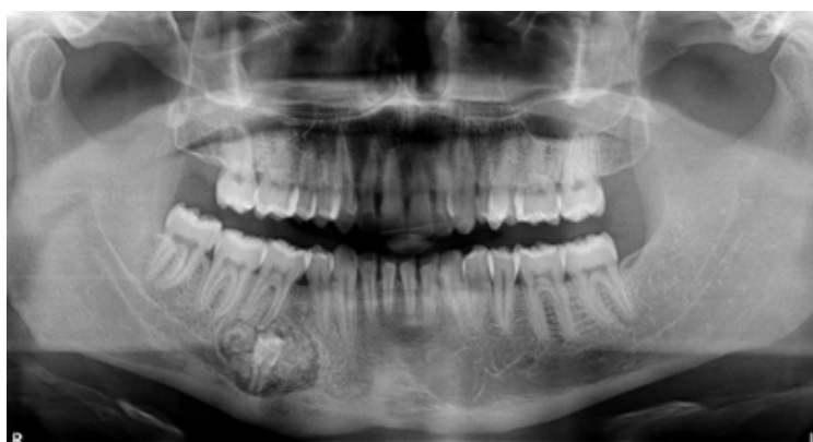
Figure 1. Radiographic image of CEOT at the time of treatment.

A 26-year-old man was referred to our clinic in May 2012. He presented with facial asymmetry and paresthesia on the right side of the posterior mandible. Intraoral examination of the patient showed a 2.5 \times 3 cm in size expansion on the buccal aspect of right molar region of the mandible. The swelling was tender and increased progressively over a period of 1 year. Panoramic radiograph revealed a mixed radiolucent-radiopaque lesion, which was multilocular with coarse trabeculae and scattered foci of calcification extending from right lower first premolar to first molar region with a radio opaque mass representing embedded second premolar ( Figure 1 : Pre-operative radiographic image shows CEOT with an impacted second premolar). The provisional clinical diagnosis of ameloblastoma, odontogenic keratocyst and malignant CEOT was made. Under local anesthesia, extraction of impacted second premolar and enucleation of the lesion were performed and the specimen was submitted for histopathology ( Figure 2 and Figure 3 shows surgical enucleation of the tooth and pathologic mass).