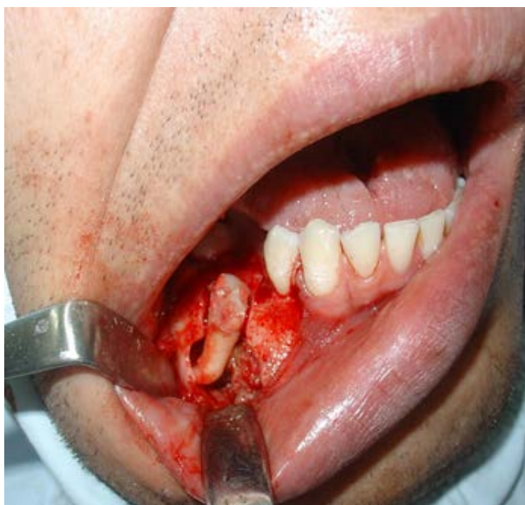
Figure 2. Surgical extraction of the tooth.