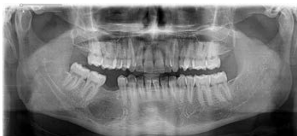
Figure 7. Postoperative radiologic appearance (36 months after the operation).

sidered by others to be typical of a CEOT [14]. Similarly, our case showed more calcifications at the crown of the unerupted second premolar. CEOT occurred premolar area of mandible with unerupted teeth in our case.