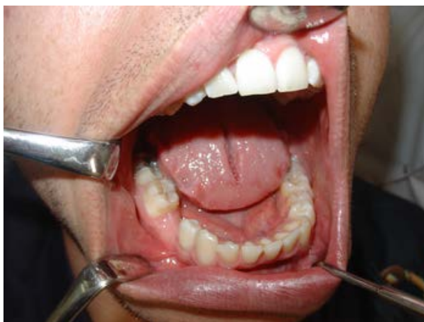
Figure 6. Clinical appearance of postoperative healing (36 months after the operation).