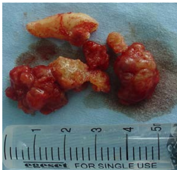
Figure 3. Surgical enucleation of the lesion.

After enucleation of the tumor, iodoform gauze applied to the cavity. The cavity was irrigated and the gauze was changed every 4 days. An impression of the cavity was taken and an acrylic obturator was fabricated. Then it inserted in after 14 days of the surgery ( Figure 4 : Clinical appearance of the surgical obturator). The obturator was reduced in size at every monthly recall. Histopathological examination showed strands of polyhedral epithelial cells with pleomorphic nuclei and calcification in the form of Liesegang rings ( Figure 5 : Photomicrograph showing liesegang rings (white arrows) and strands of polhedral epithelial cells with pleomorphic nuclei [H & E \times 100]). The diagnosis confirmed calcifying epithelial odontogenic tumor. Numerous spherical calcified masses were seen in a background of cellular degeneration with scant fibrous stroma. At the eight-month post-operative visit, the patient had no complaints expect parasthesia. After three years of the operation, bone healing in the affected area was progressing well ( Figure 6 and Figure 7 : Postoperative clinical and radiological appearance (36 months after the operation shows bone healing with no recurrence).