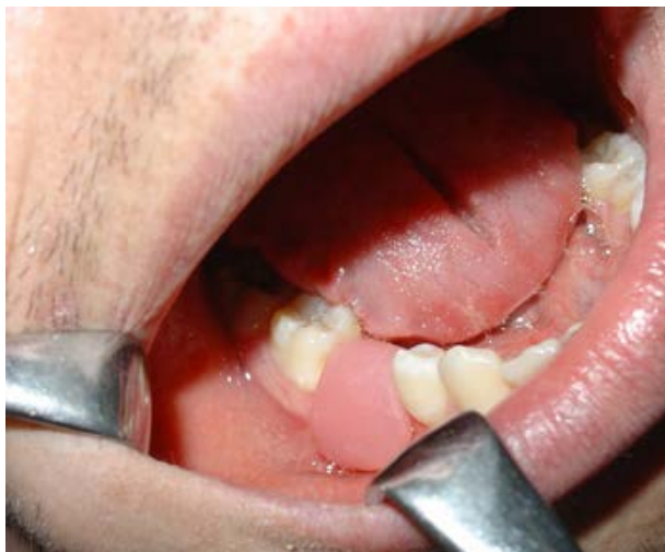
Figure 4. Clinical appearance of the surgical obturator.