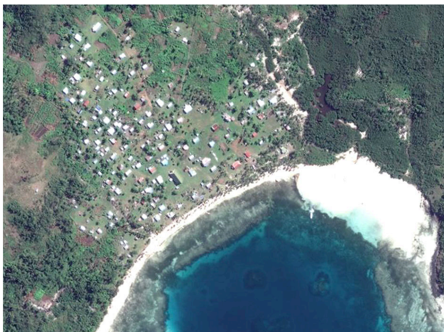
Figure 6. The sand eroded and removed from the village beach was deposited in a huge accumulation in the embayment to the northeast.

At Yageta Village quite severe erosion (Figure 5) and re-deposition of sand (Figure 6) occurred. It seems that this was initiated by the removal of “thousands and thousands of sea cucumbers” affecting the stability of the sand off the beach of the village.