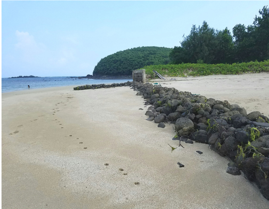
Figure 3. Jetties were built in order to extend the resort area. This blocked the existing coastal longshore-drift and current direction, which led to a reversed circulation with a gyre hitting the shore just where the erosion ( Figure 2 ) occurred. Photo taken at low tide.

the longshore transport seems to have stopped ( Figure 4(b) ). In the image from 2016 ( Figure 4(c) ), a reversal of the original coastal current transport is recorded. Now there is a strong transport to the west. Obviously this change in coastal current direction and motion of sediments is linked to a gyre in the current, turning to the beach, where it caused coastal erosion ( Figure 2 ) over a distance of a few tens of meters; i.e. just where the current hit the shore.