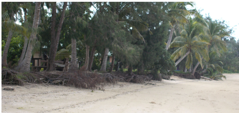
Figure 2. Erosion at Long Sandy Beach due to redirected coastal currents. The redirection of currents was caused by the error of building a jetty. The photo was taken at low tide, with the HTL visible as a dark line on the beach.