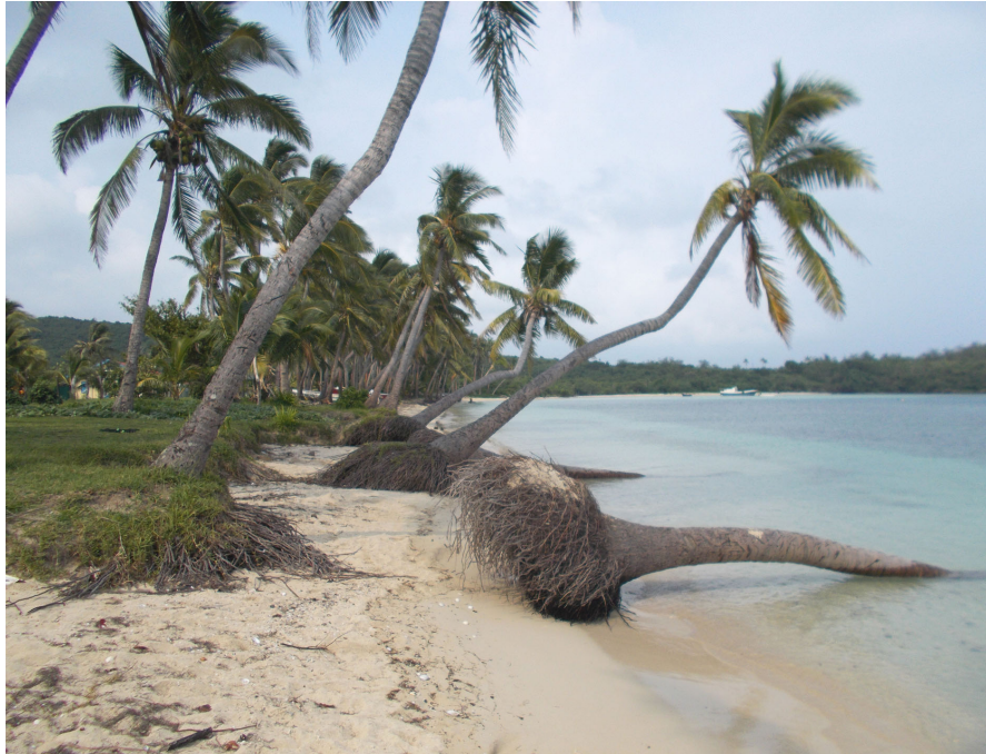
Figure 5. Erosion and beach damage along the shore of Yageta Village. The sand removed was transported north-eastwards and formed a huge accumulation where the boat is in the background.

image, suggesting a young deposition not yet properly redistributed with respect to currents, waves and tides.