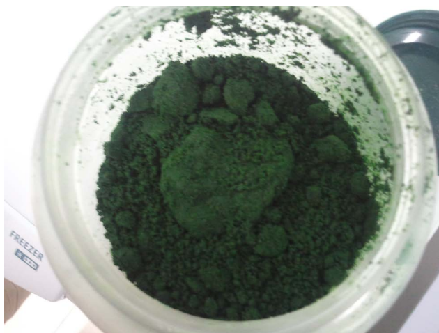
Figure 1. Biomass humid of microalgae Chlamydomonas sp.