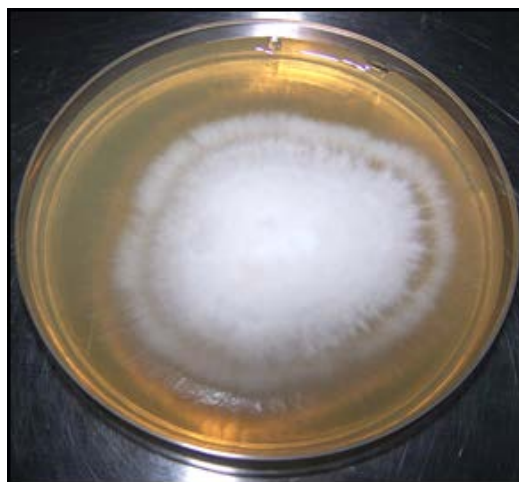
Figure 1. Colony diameter of eight day old (negative control).

The results also showed that the Mentha piperta oil at concentration of (0.1%) completely inhibited the growth of M. canis . These findings indicated that the required dose of the essential oils in this study to inhibit the growth of clinical M. canis isolates was very low and the dose of M. piperta oil was almost half of the other oils tested in this study. As in another studies, O. majoranum , C. citratus , and T. vulgaris were of the best broad-spectrum candidates for inhibition of food-borne pathogens and spoilage organisms. C. citratus and T. vulgaris were all clearly inhibitory towards the fungi [15] [16], Mentha piperta oil shown high antifungal activity against clinical M. canis isolates.