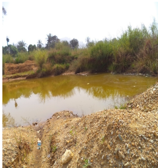
Plate 5. Evidence of visible environmental impacts. A scene of pool of water in an un-filled mined pit in Baomahun (Source: Author's field survey data, 2015).