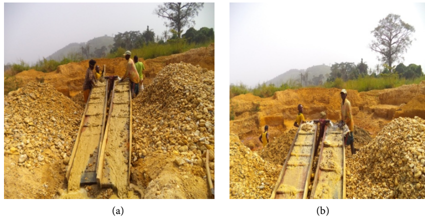
Plate 2. Artisanal gold washing process in Baomahun using a wooden sluice box. (Source: Author's field survey data, 2015).