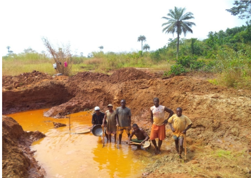
Plate 1. Artisanal miners working in an open pit filled with water.

dig a vertical opening into the mine called a shaft using hand tools such as hammers; hand forged scrap-steel chisels and spades. Then they drive a nearly horizontal or sloping mine entrance passage into the side of the hill called an adit . From these main passages, miners dig systems of horizontal passages called levels running the risk of collapsed walls and oxygen shortages to extract the gold that the world demands. However, some miners used old adit left by former mining company in the area.