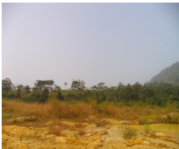
Plate 6. Scene of soil depression.

The study shows that residents suffered from mining related ailments. Malaria was recorded as the most prevalent and bears the highest percentage of 29.41%; this is because the open mines left behind by mining carry stagnant water, which are favourable breeding grounds for mosquitoes. Cold and catarrh bears the second highest percentage of 17.65%, followed by skin diseases (15.44%) ( Table 2 ).