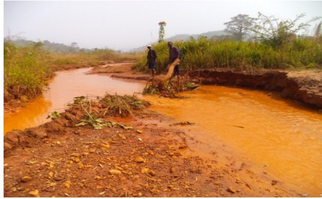
Plate 4. Evidence of stream turbidity, diversion, and sedimentation.