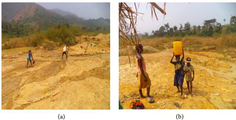
Plate 7. Undeniable evidence and proof of the use of child labour in mining site.

The research revealed that the methods used by artisanal gold miners in their