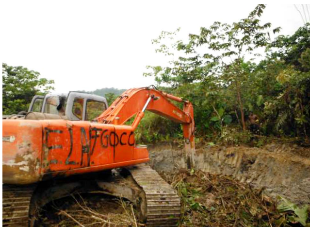
Figure 8. Security in the gold mining areas is a serious concern. The graffiti on the backhoe indicates the presence of ELN (Ejército de Liberación Nacional/National Liberation Army), an armed paramilitary group, in the mining area [5] [20].