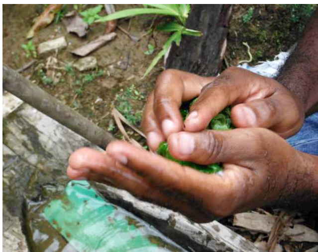
Figure 3. Crushing the Malva leaf by hand with water makes a foamy liquid.