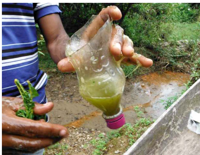
Figure 5. The liquid that results from hand crushing the plant with water is added to the batea in place of mercury.