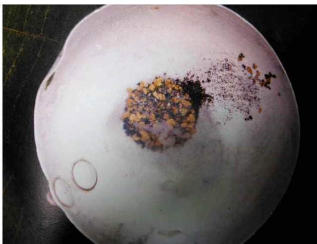
Figure 6. Gold pan with green gold and magnetite ( jagua ) [16].