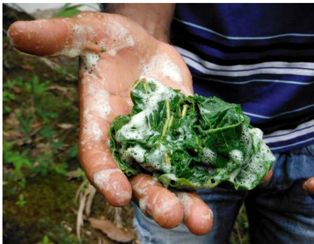
Figure 4. Crushed Malva leaf.