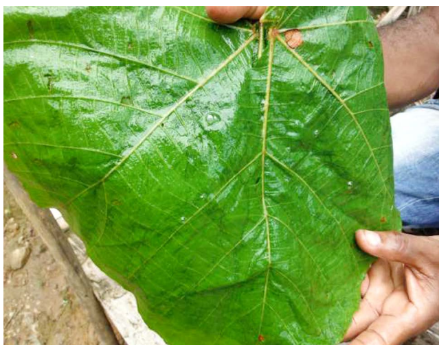
Figure 2. Malva leaf before crushing.

One or two leaves from the plant, for example, Balso, Malva, Cedro playero or other, are crushed by hand and mixed with water to make a foamy, sticky liquid (Figures 2-7). Mainly the liquid is added to the gold concentrate in the gold pan ( batea ) in place of mercury, the coarse gold and heavy minerals ( jagua ), such as magnetite, sink, and the remaining sedimentary material that may include quartz, feldspars, and lighter minerals remains suspended and are poured out of the batea (Figure 6, Figure 7) leaving a gold concentrate [14] [16] [17]. The green gold process is effective because: 1) it produces a soapy mixture that traps and floats lighter minerals effectively separating them from the denser gold [11] (Table 1); and 2) at the same time, the plant juice-water mixture breaks the surface tension of the water and allows precipitation of the very fine-grained gold (Figure 6) that would normally float away; and therefore, the green gold process increases gold production. The process is analogous to minerals separation by the use of heavy liquids, that is, the soapy plant juice allows the high specific gravity minerals such as gold, platinum, and magnetite to sink while the low specific gravity minerals (quartz, feldspars, and micas) remain suspended and can be poured out of the gold pan leaving a gold concentrate.