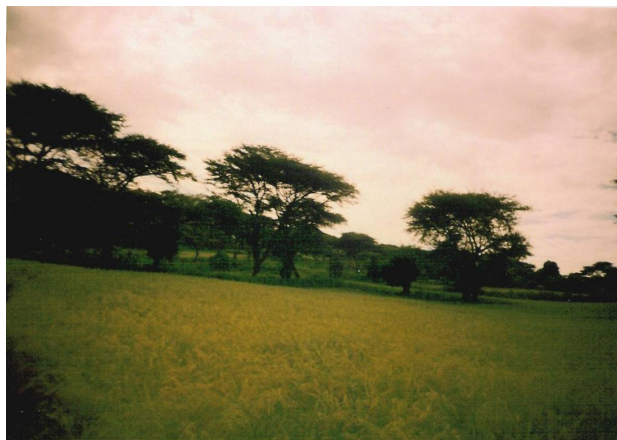
Figure 3. Traditional agroforestry on the islands of Lake Ziway.

consumption. Charcoal production was insignificant on the islands. Absence of cutting and use of trees for sale is partly a reflection of low pressure on the natural vegetation.