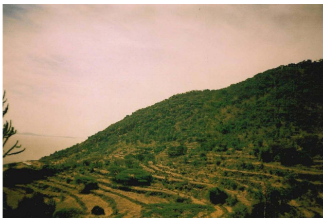
Figure 2. Terracing on the islands of Lake Ziway.

The Zay people also have important traditional vegetation management systems and practices, which have contributed a lot for the maintenance of the vegetation resources in the absence or very little involvement of government bodies. They construct their housewall with stone and earth. This makes the house durable and thereby reduces the turnover of cutting trees for house construction. They use dried and fallen logs for fuelwood. They do not cut trees for fuelwood but for construction material, farm implements and other purposes. They use fuelwood mostly for cooking and only rarely for lighting. They do not sell wood products but use them only for