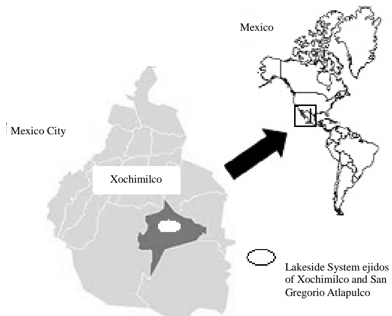
Figure 1. Lakeside system ejidos of Xochimilco and San Gregorio Atlapulco, Mexico.

The Lakeside System of Ejido Xochimilco and San Gregorio Atlapulco is located in the central-southern part of Mexico City, Mexico and has an area of approximately 2657 ha [15] (Figure 1). Due to its adjacency with the urban area, there is strong pressure within the site, so there is presence of irregular human settlements, the population living in this area is estimated to be 24,100 inhabitants and in the area of immediate influence 121,130 inhabitants [15] [16] [30]. Also, the lakeside system, declared it a protected natural area, it is located in the so-called soil conservation, it constitutes a remnant ecosystem of the Basin of Mexico formed by natural flooded plains and induced water bodies [16] [31].