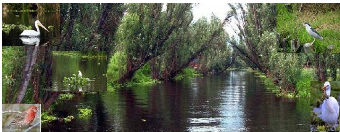
Figure 2. Birds and landscape ( Chinampas )—ejidos of Xochimilco and San Gregorio Atlapulco, Mexico.

The final survey for both national and international birdwatchers is divided into three sections. The first where it asks general aspects of bird watching activity performed by each respondent. In the second section, there is an explanation of the importance of Xochimilco in the flyway of birds from North America to Central and South America to then ask the respondent about aspects of bird watching in Xochimilco and their willingness to pay for conservation of this place. Finally, the third part is destined to find out socioeconomic aspects.