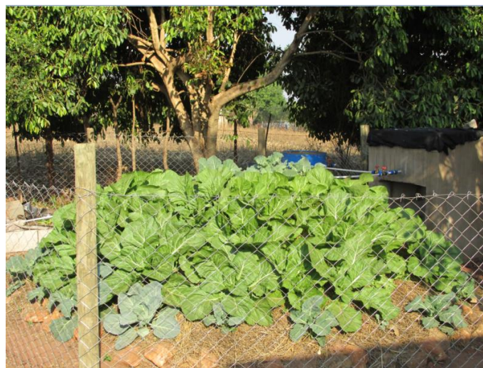
Figure 3. Photograph of the grey water dam with vegetables grown on the surface.

The intermittent nature of the grey water generation from the yard tap water connection suits the grey water dam as air is drawn during part of the time when grey water is not supplied to the dam and facilitates aerobic breakdown of organic matter within the grey water dam. It is essential that water is fed slowly into the grey water dam. Supplying grey water at a high rate results in overflow, over saturation (soaking) of the grey water dam