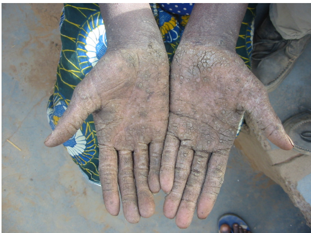
Figure 3. Palmar keratosis (skin cancer).

value should therefore be subjected to prior treatment. Affordable technologies are available [18]. When this treatment is not possible these water points should be prohibited for human consumption until treatment is found.