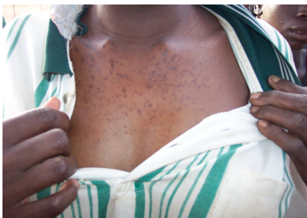
Figure 2. Skin hyper pigmentation.

shows the target exposure and the effects of arsenic on humans in the North region, Burkina Faso.