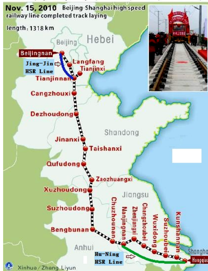
Figure 2. Sketch map of redundant construction on Beijing-Shanghai (Jing-Hu) CHSR (WR21).