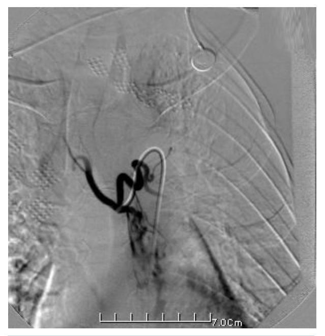
Figure 2. Radiography showing the peripheral cut off in flow after embolism.