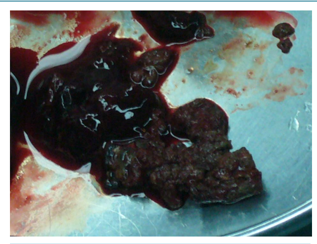
Figure 5. Postoperative ball and blood-stained tissue.

chial trees. Ninety percent of significant hemoptysis come from bronchial artery origin. Mssive hemoptysis was a life-threatening condition with a high mortality when treated conservatively. Medical treatment of massive hemoptysis carried a mortality rate of 50% to 100% [1]. Interestingly, varying definitions in the literature exist of massive hemoptysis. These range from 100 to over 1000 ml in a 24-hour period [9].