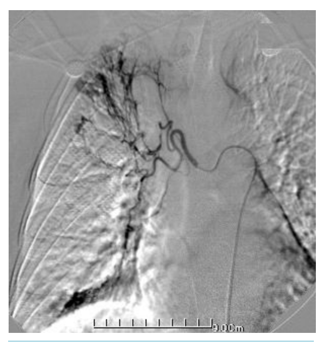
Figure 1. Radiograph showing enlarged bleeding bronchial arteries.

All suffers with severe hemoptysis were treated by an integrated management, including psychology, anticoagulants, vasoconstrictor agents. Etiological treatment including anti-tuberculosis and anti-infection was simultaneously or subsequently involved. Sixty-four inpatients with severe hemoptysis being failed to be cured by medical treatment were then received selective bronchial artery embolization (BAE) ( Figure 1 , Figure 2 ). After BAE, they expectorated a minor amount of blood or bloody sputum, which gradually disappeared after 48 to 72 hours. No severe complications were observed in any of the cases as a result of this intervention except for moderate prothorax pain in 6 cases. But the transient chest pain disappeared within 24 hours by the oral anal-