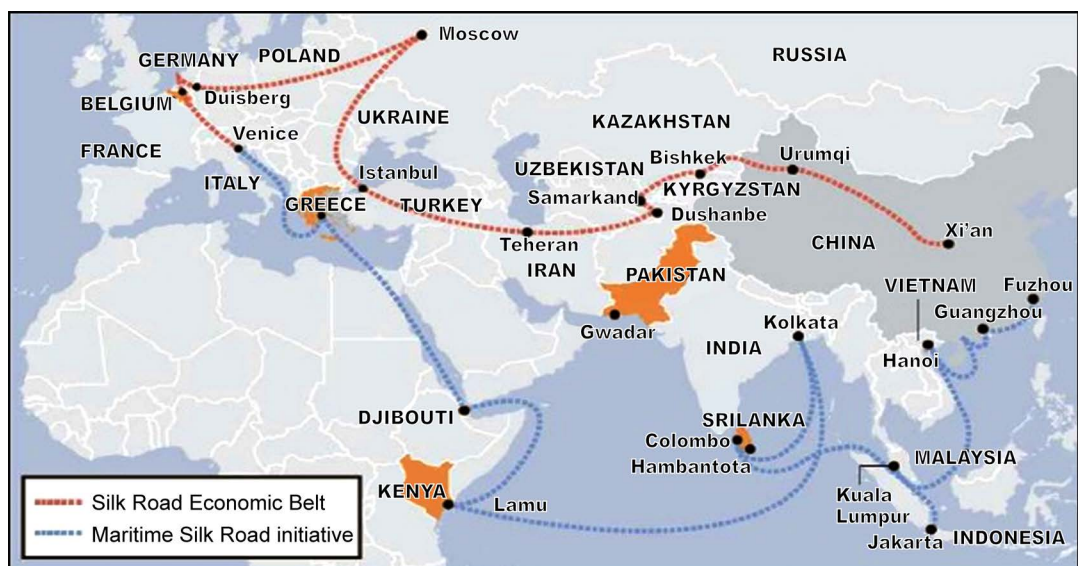
Figure 2. Planned trade routes in OBOR (BOCOM international, 2015) [23].