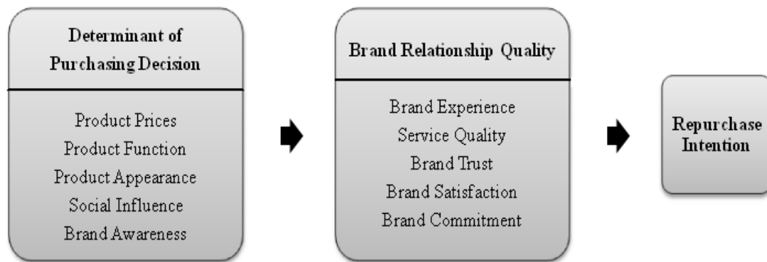
Figure 2. Research framework.