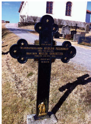
Figure 3. A cast-iron cross from Myckleby dated to 1875. Three stars decorating each arm and the top symbolize light. A winged angel decorates the foot.