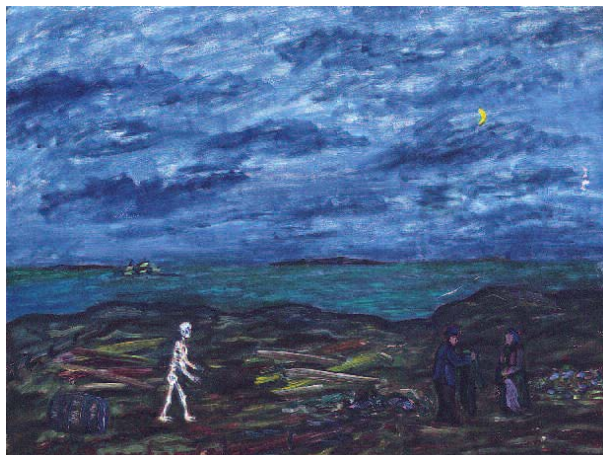
Figure 4. A ghost of the little island of Gåsö cries that he is freezing and wants his clothes back, to the dismay of the man and the woman standing to the right. Painting by Carl Gustaf Bernhardson. Bohuslän Museum, Uddevalla, No. 225.

People tried to protect themselves against ghosts by using protective agents that were common in traditional folklore. It was important to obtain such protection as this is mentioned in a great number of records. People sprinkled flaxseed, ash or salt just after death and around a funeral. This way the deceased who were likely to become ghosts could be prevented as they had to pick up all the seeds on the night before the sunrise. Then they had to return to their graves (IFGH, 740, p. 86, Böne in the province of Västergötland). Another way of protecting against ghosts was described by an informant born in 1862 in Seglora in the province of Västergötland: “People sprinkled burnt seed or corn on the road and said, ‘Now, you will not go over here before this seed grows up’” (IFGH, 4602, p. 35). It would be as difficult as possible for ghosts to come.