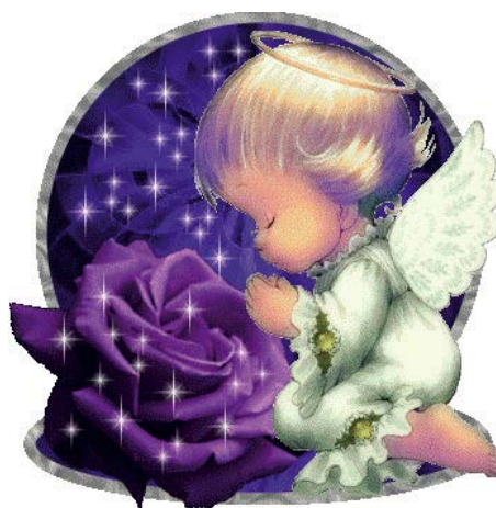
Figure 6. The mother of the deceased daughter has written: “Hugs from your beloved mother”. The angel has a halo and wings [20].

The older folklife records hardly maintain that people are expected to get reunited with their deceased relatives after death and thus be together forever. However, such beliefs are expressed in Christian texts in the