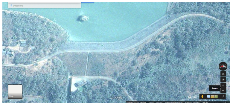
Figure 2. Aerial view of Ikere gorge dam using Google maps.

Results were obtained using the standard hydropower equations with the data obtained from the site (Ikere gorge Dam) coupled with some other fundamental fluid property values [18]. The Aerial view of Ikere gorge dam site using Google maps is as shown in Figure 2 and Figure 3 . The analysis done to obtain the results is as follows.