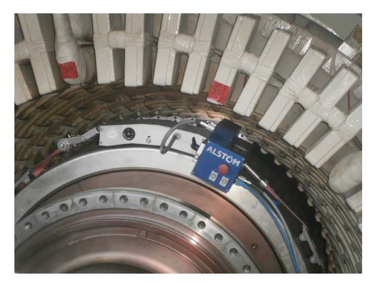
Figure 3 DIRIS Small air gap robot deployed on a 175 MW generator of North American manufacturing origin.