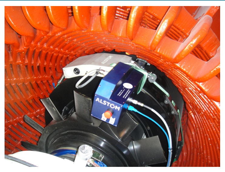
Figure 2 DIRIS Small air gap robot deployed on a 60 MW generator of European manufacturing origin.