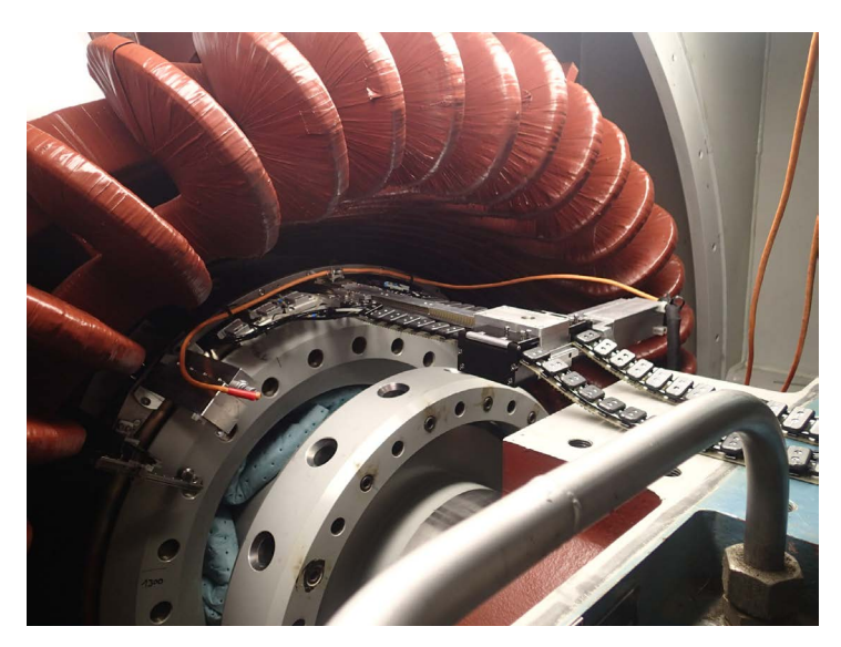
Figure 5. TurboRotoscan-S deployed on a 40 MW generator of European manufacturing origin.

retaining rings and has computer controlled axial and circumferential movement of probe heads to map the body of the retaining ring metal for defects. The system is intended for a wide range of types and sizes of turbo generators. Due to its lightweight structure the robotic tooling can be hand carried to the work site with relative ease.