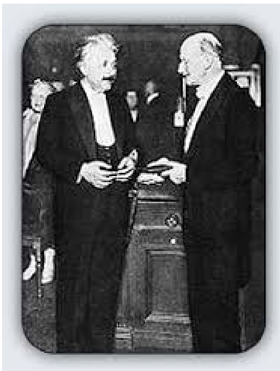
Figure 3. Einstein (left) with Max Planck.

https://encrypted-tbn1.gstatic.com/images?q=tbn:ANd9GcSOd0Fi9Mgr3stO4Q84WsnUXmBHD83hUkVoi6xaiyav9rCyxnl1