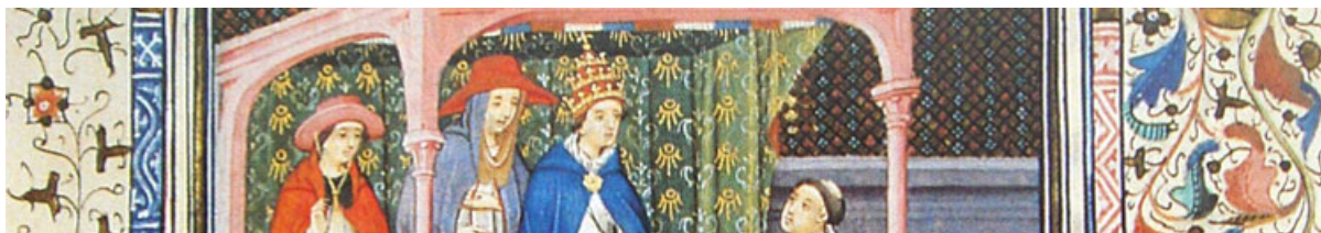
Figure 1. Universiteit Leiden welcome motif. http://www.leiden.edu/uploads/homepage/hp14.jpg Welcome motif of the Dutch university where the (modern) discovery of m = E/c^2 ( E = mc^2 ) was announced in print for the first time.

In calculations we reported recently [3], the System of the World contains two kinds or species of points: i -points which form a substrate in the frame of which they bear no (geometric) relations of distance or proximity with each other; and e -points (endpoints) which form a structure having characteristics that Isaac Newton once attributed to Absolute space. When one of these points is randomly set in motion, it acquires a momentum p