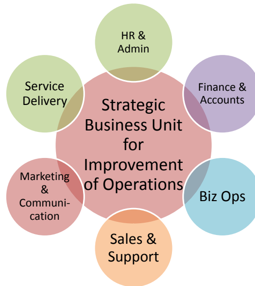
Figure 2. Proposed new structure with resource pooling. The SBUIO shows both overlapping relationships and the relationship of a central idea in a cycle. Every function outside corresponds and combined to make the unit efficient and multi-tasking unit.

and proposing a conceptual framework on the subjects. The authors further suggested including other variables which may include the organization strategies, its structures and policies, the leadership styles and beliefs and others that might be of help to explain the relationships extensively. Keith McIntosh et al. [13] studied the expanding the Recruitment Pool in human resource pooling through increasing diversity, equity, and inclusion to increase the organizational efficiency. Based on the above limited research and models, the researchers have developed the theoretical framework and identified the following can be areas that can be grouped and assigned multiple tasks: