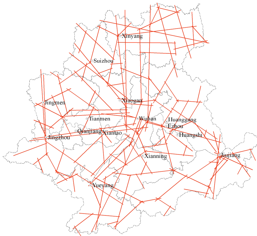
Figure 2. The axis map of road network of Wuhan metropolitan area .

Each spatial syntactical variable of road network is significantly classified, forming three levels: The first level traffic axial lines' connectivity ( C ) is \geq 9 , the control value ( ctrl ) \geq 2 , three-step depth value ( D ) \geq 50 and integrated transport axis RA \geq 1.7 , accounting for no more