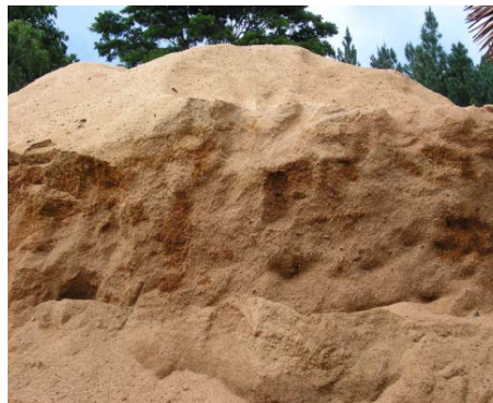
Figure 2. Heap of saw dust Source: [25].