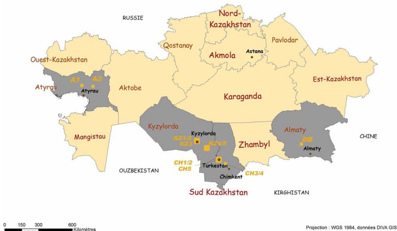
Figure 1. Map of sampling sites of camel milk and shubat in Kazakhstan.

This analysis was achieved by ICP methods (Inductively Coupled argon Plasma–Atomic Emission Spectrometer