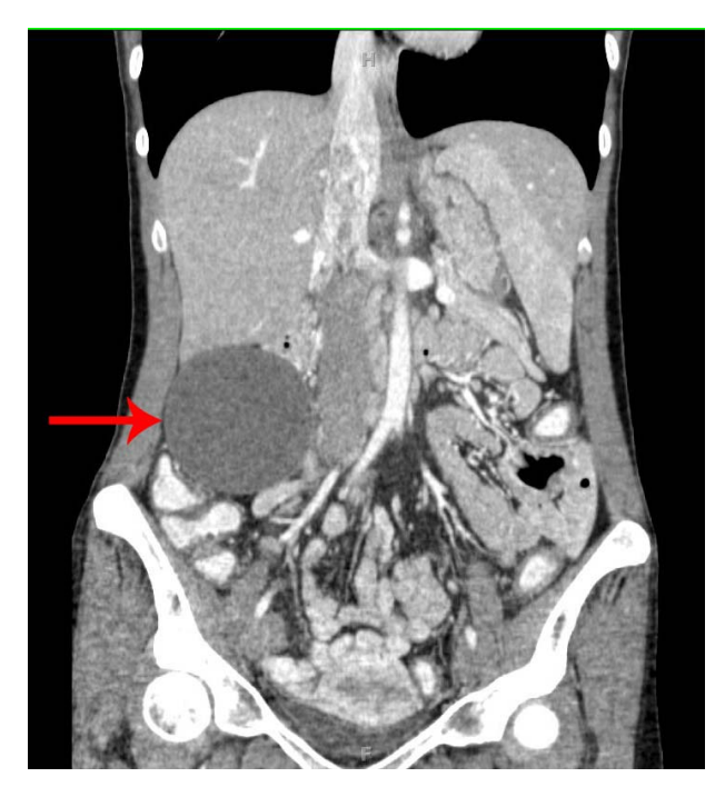
Figure 2. Coronal CT scan demonstrating a large cystic lesion (red arrow).

Following the percutaneous aspiration, the patient's symptoms initially resolved. The pathologic evaluation of the aspirate revealed dark colored fluid, with atypical cells, without any histologically noticeable pathology. The cyst and her symptoms however recurred shortly thereafter and the patient was therefore referred to the surgeon for definitive therapy.