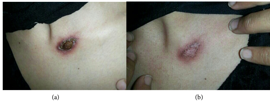
Figure 2. Forty years old female with cutaneous leishmaniasis on the chest (a): before treatment, (b): after 4 weeks treatment with 25% topical podophylline solution.