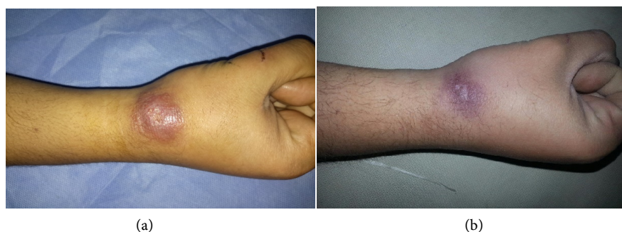
Figure 3. Thirty five years old male with cutaneous leishmaniasis on the right wrist. (a): Before treatment, (b): After 4 weeks treatment by 40% Loranthus europaeus ointment.

There were no significant difference in the grades of responses in relation to the durations in the treatment between group A and group B, were: