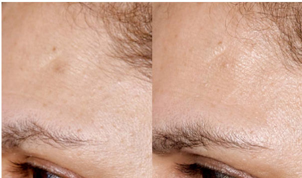
Figure 12. Forehead pigmentation before (left) and after 1 month.

Most patients expressed their degree of satisfaction to the overall improvement of facial skin after 1, 2, and 3 month follow-up sessions, as described in Table 2 . Patients related to skin texture (pores, elasticity and firmness), to fine line and wrinkles and to pigmentation. No one experienced lack of response. Most patients (88% - 91%) reported considerable and some response at all 3 points of follow-up.