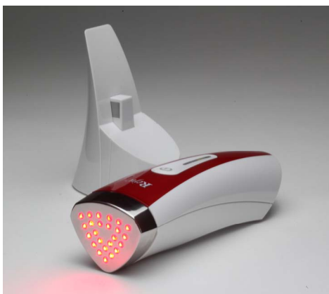
Figure 1. Silk'n Reju/FaceFX facial skin rejuvenation device and charging cradle.

Patients were guided how to use the equipment and treated themselves under the guidance of a qualified person in the study sites clinics. Facial treatment zones were