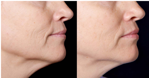
Figure 4. Perioral wrinkling before (left) and after 1 month (right).