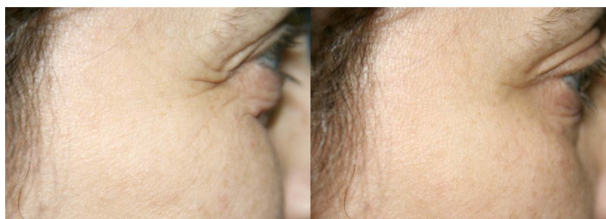
Figure 5. Female periorbital wrinkling (crow's feet) before (left) and after 3 months.