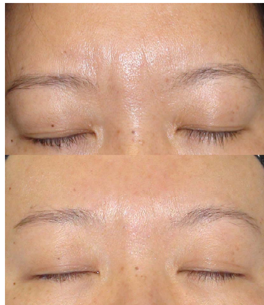
Figure 8. Forehead wrinkling before (top) and after 2 months (bottom).