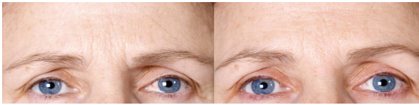
Figure 9. Forehead wrinkling before (left) and after 1 month.