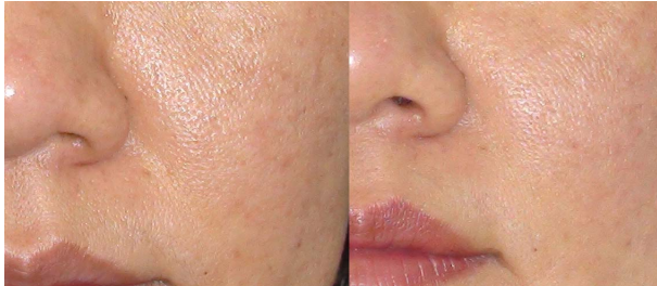
Figure 10. Large pores before (left) and after 2 months.