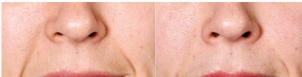
Figure 11. Nasolabial folds before (left) and after 1 month.