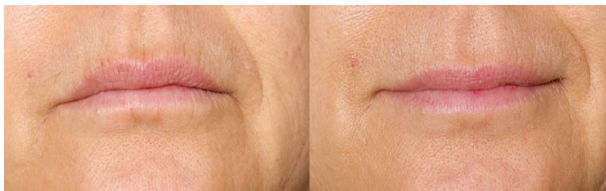
Figure 3. Upper lip smoker lines before (left) and after 1 month (right).

Results evaluated by a blind independent physician are summarized in Table 1. The results show that as time elapses, there is a gradual improvement in all lesions. At 3 months follow-up, 94% and 98% of patients were evaluated as having excellent or considerable improvement in wrinkling and skin texture, respectively. Improvement of pigmentation was less apparent and was recorded after 3 months as 45% of patients having excellent or considerable improvement. There were no non-responders, and 5% of patients showed poor results only for pigmentation.