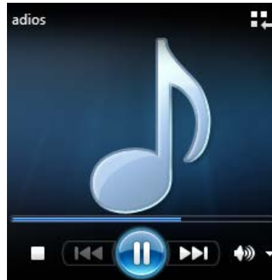
Figure 5. Audio (before encryption).

In this work key space size of 128 bit was used and this is large enough to oppose every form of brute-force attacks. During the encryption of this image using different keys, AES was observed to be very sensitive to the secret key. In the encryption code, the output of the encryption was structured to be in the form of ciphertext not encrypted