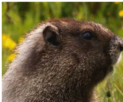
Figure 3. Original image (before encryption); Source: wildlife [24].

With the objective of frustrating powerful attacks based on statistical analysis, two methods of confusion and diffusion were proposed by Shannon [22]. The superior diffusion and confusion properties of AES have been demonstrated by performing statistical analysis on it in [23]. The ciphered image in the AES algorithm was observed to be rather identical and appreciably different from the unencrypted image in Figure 3 . And most assuredly, after implementing the encryption in Figure 4 and decryption stages, there was no loss of any kind in the quality of the image and the decrypted file was the same in magnitude with the original image in Figure 3 . This observation was the same for the audio file in Figure 5 , all in AES algorithm; the size of the original audio was 36