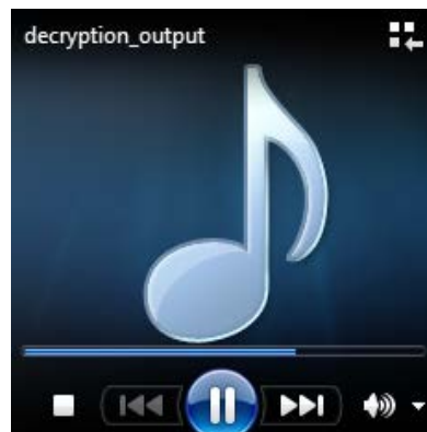
Figure 7. Decrypted audio (after decryption).