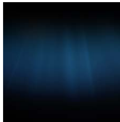
Figure 6. Encrypted audio (after encryption).