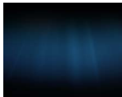
Figure 4. Encrypted image; After encryption.