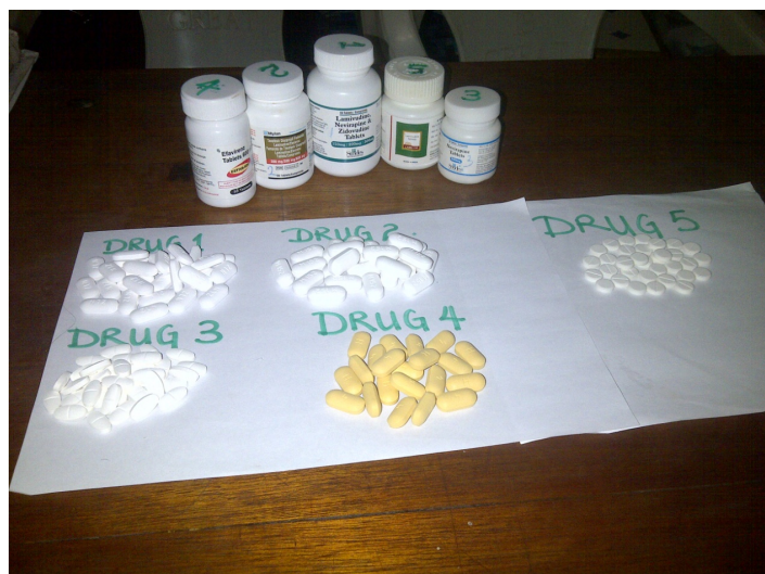
Figure 1. The tablets of the five different antiretroviral drugs used.

The popular and commonly used unexpired Antiretroviral drugs (three single tablets and two HAART), from the University of Nigeria Teaching Hospital (UNTH) APIN CENTRE PEPFAR, Ituku-Ozalla, Enugu State were collected (see Figure 1 ). Table 1 shows the details of the five different antiretroviral drugs used in the study.